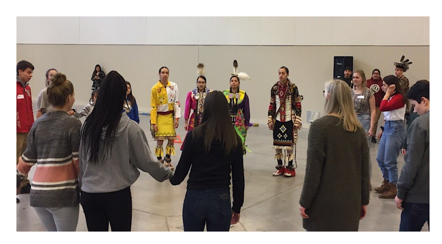
Students from Eastdale Secondary School enjoying some dancing at Youth and Elders. (March 9, 2018)