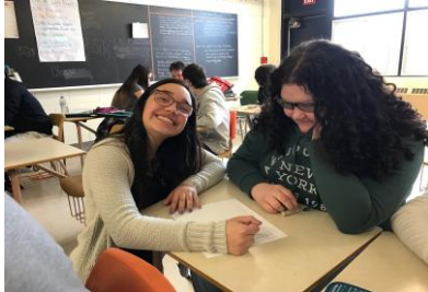
Support in a Grade 9 English Classroom