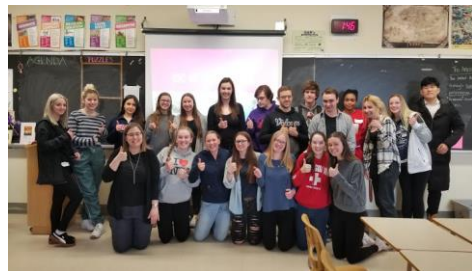
Students Participating in April 17 Workshop