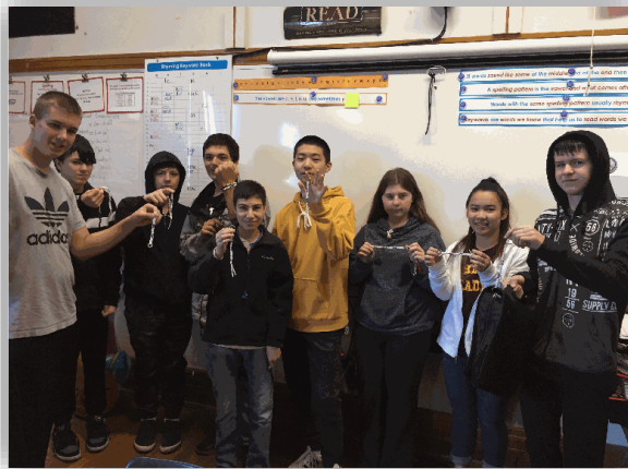
Students at St. Catharines Collegiate SS learning about Treaties.

The DSBN Academy students led daily video announcements that included Land Acknowledgment, teachings of the Dish with One Spoon and Two Row Wampum Treaties. Students also participated in a smudge.