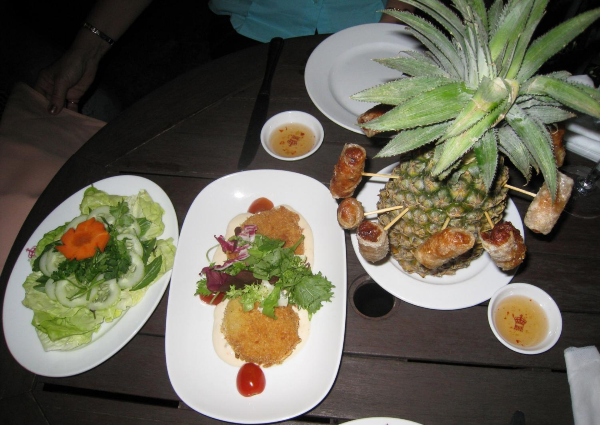
Traditional Vietnamese Food