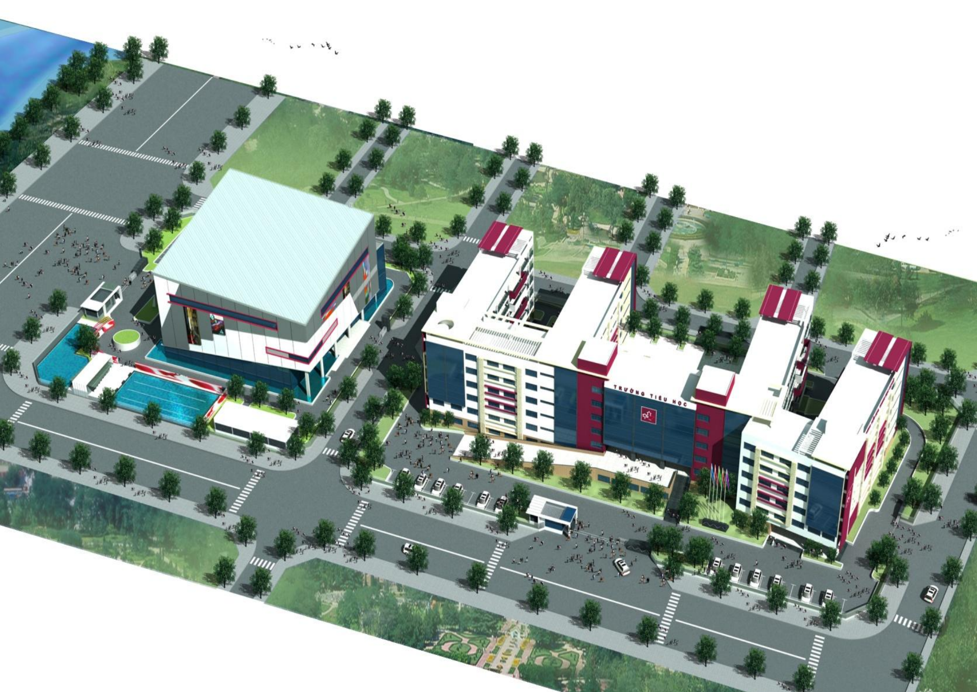
Arial Depiction of the Canadian International School—Vietnam