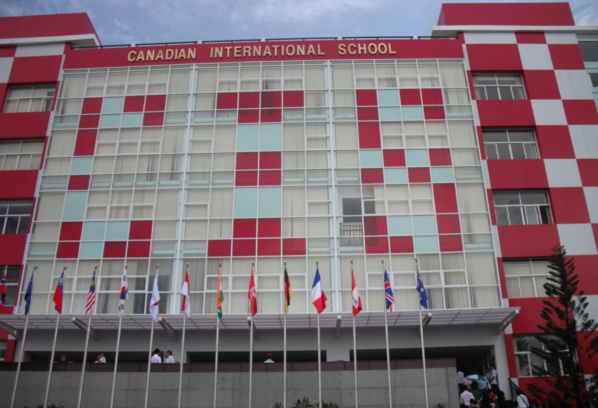
Front View of the Canadian International School—Vietnam