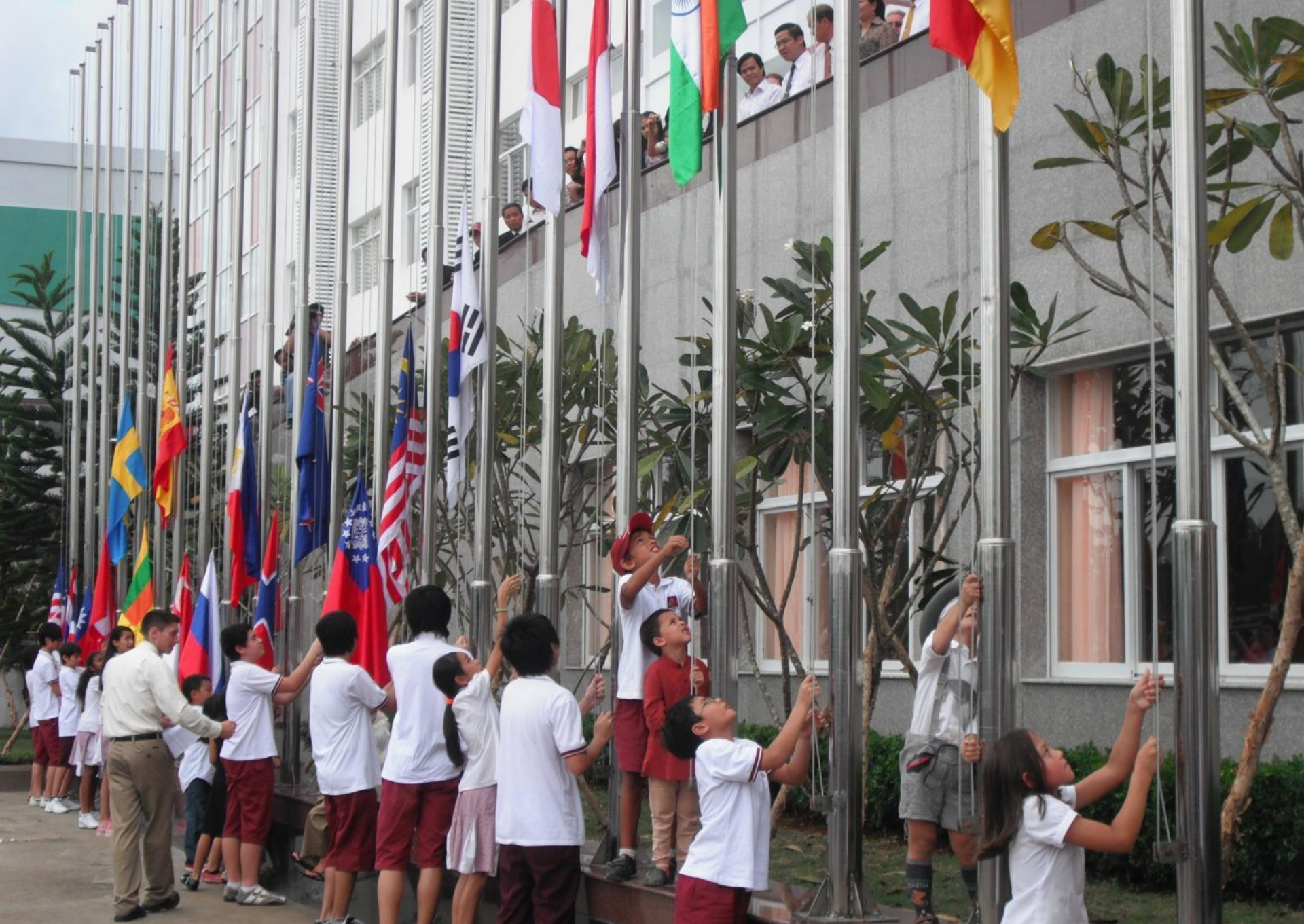
Flag-raising Ceremony at Grand Opening (25 countries represented in student body)