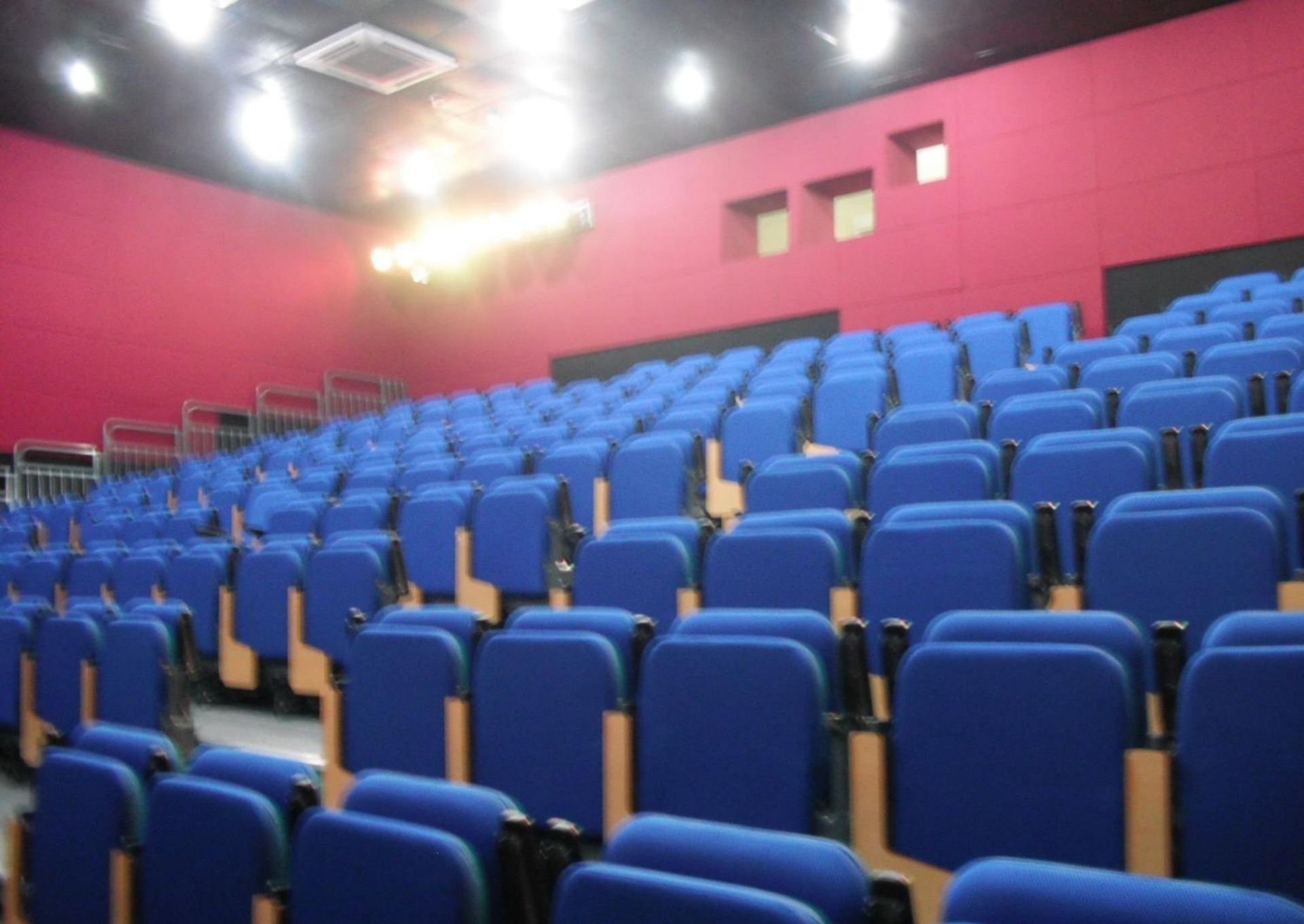
Two Theatres (Drama and Movie)