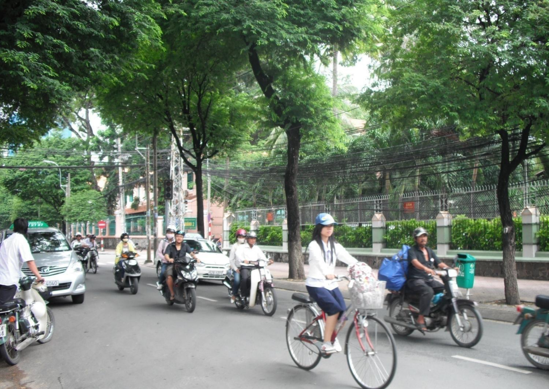
Getting around on primarily motos in HCMC