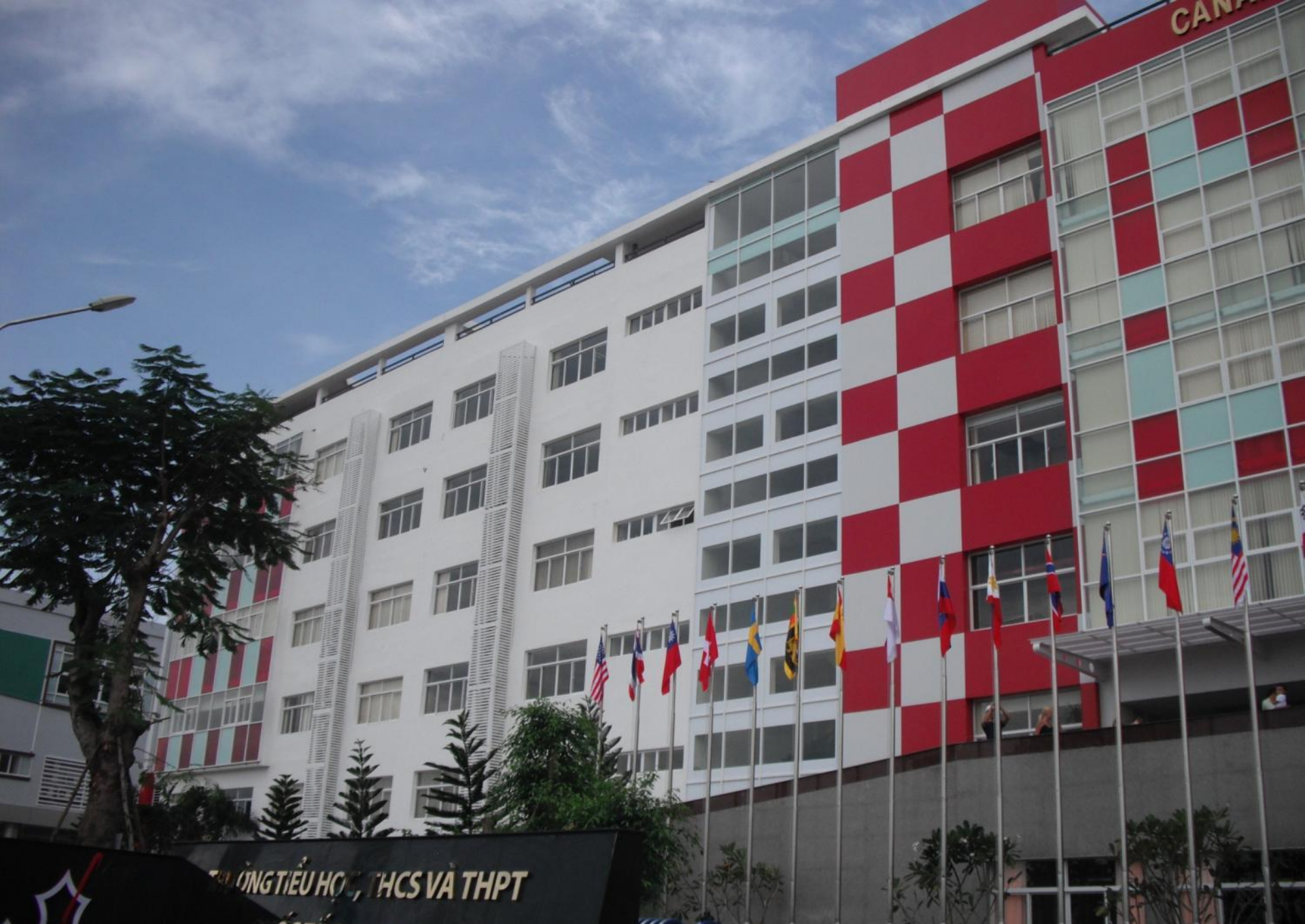
Front View of the Canadian International School—Vietnam