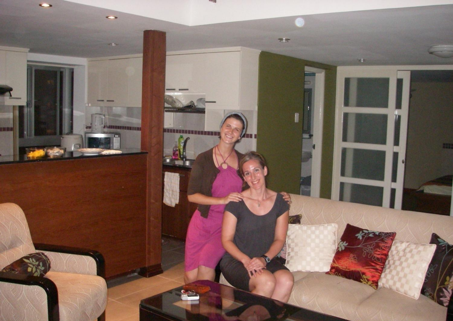
Shared Apartment in modern building