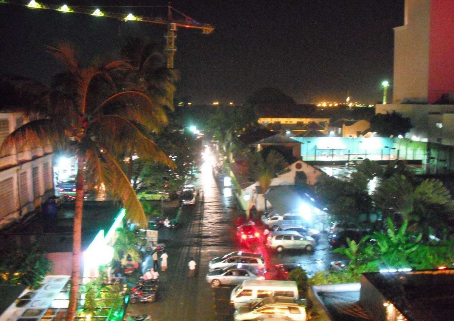
Vibrant Life in HCMC