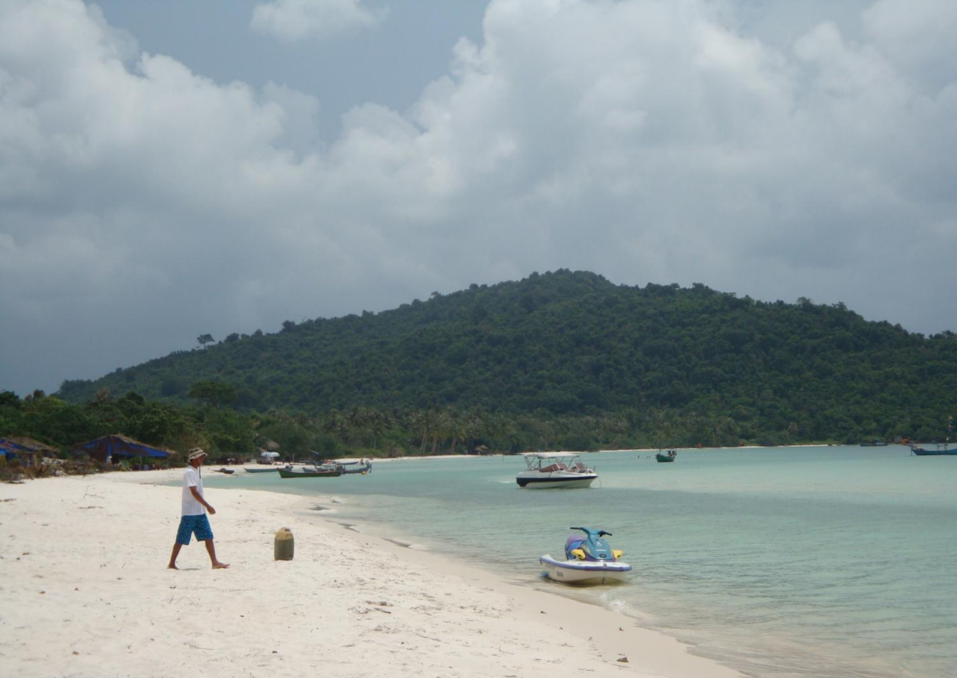
Beach on Gulf of Thailand