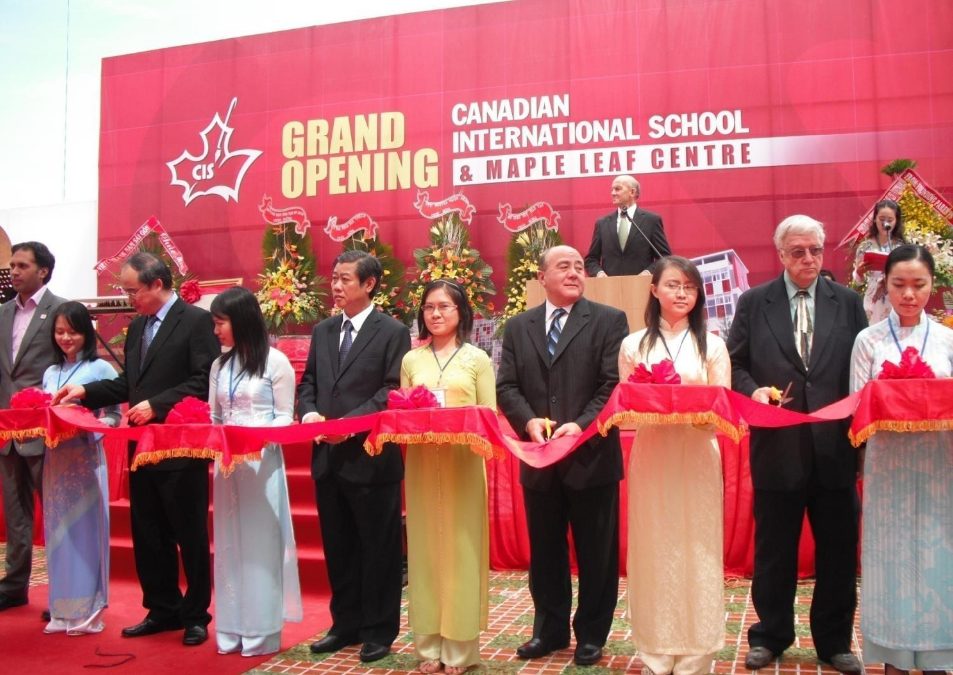
Opening Ceremony of Newly Constructed Campus of CIS, 2010