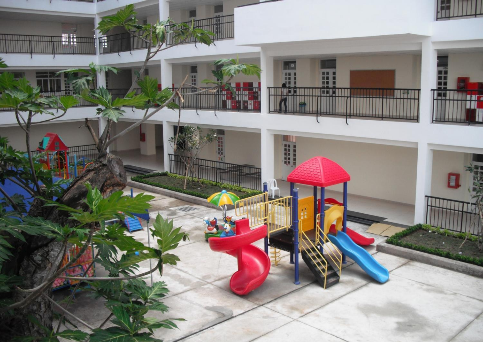
Outdoor Primary Play Area