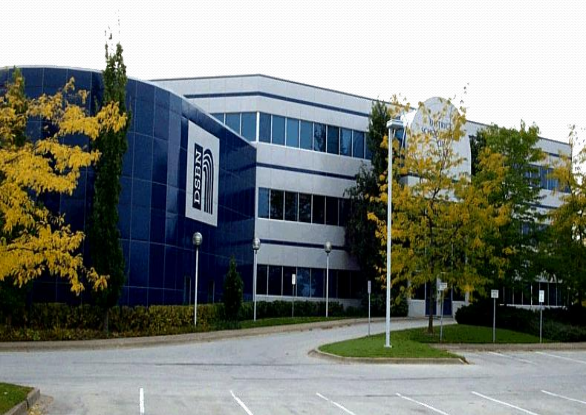
District School Board of Niagara, St. Catharines, ON, provides consulting services to CIS