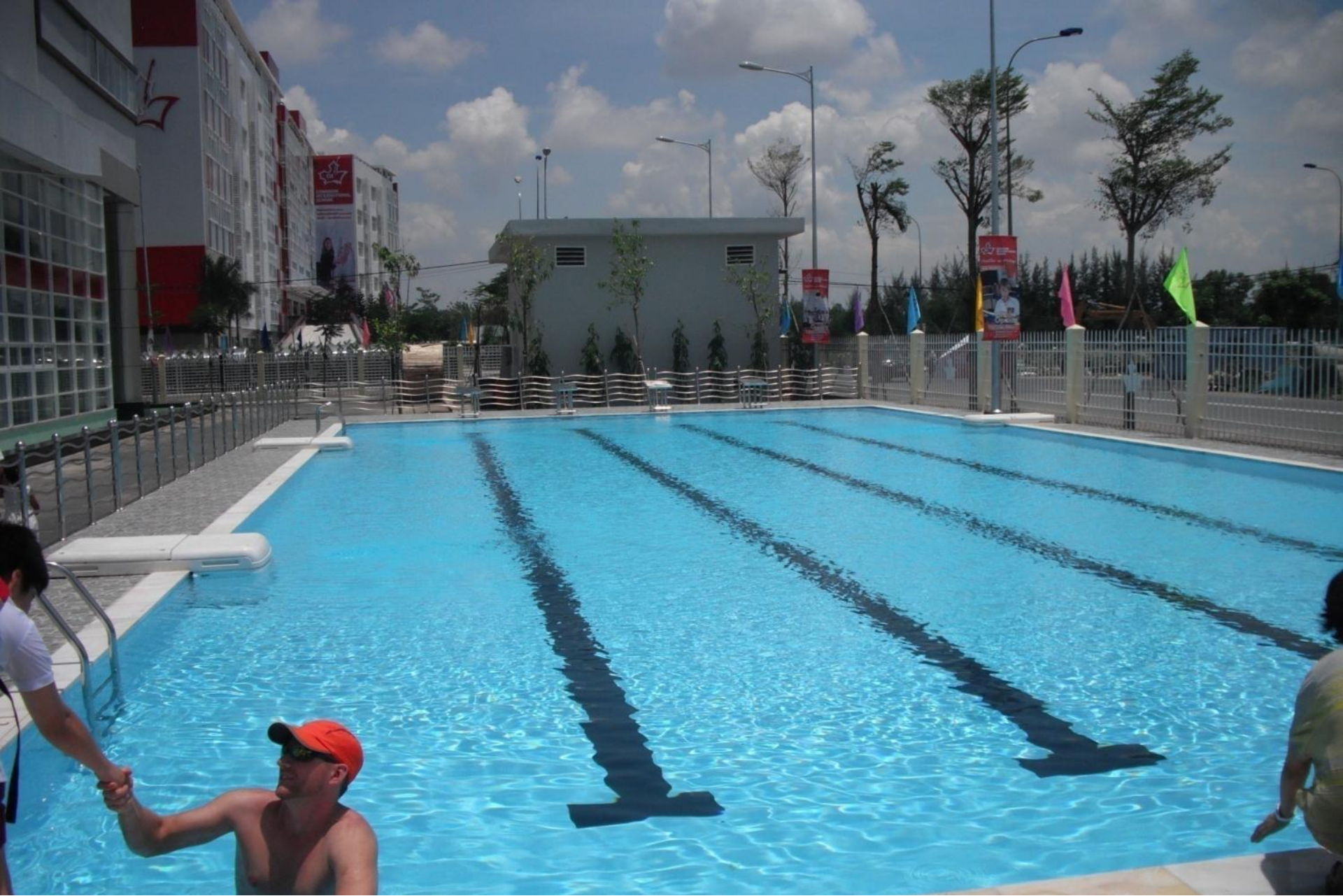
Two outdoor swimming pools