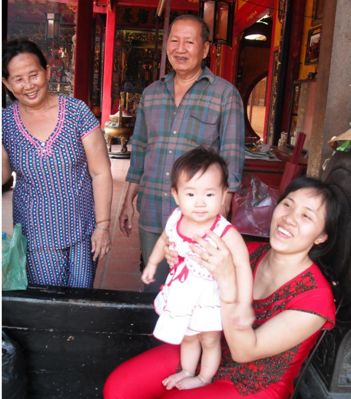
Family in a Buddhist Pagoda