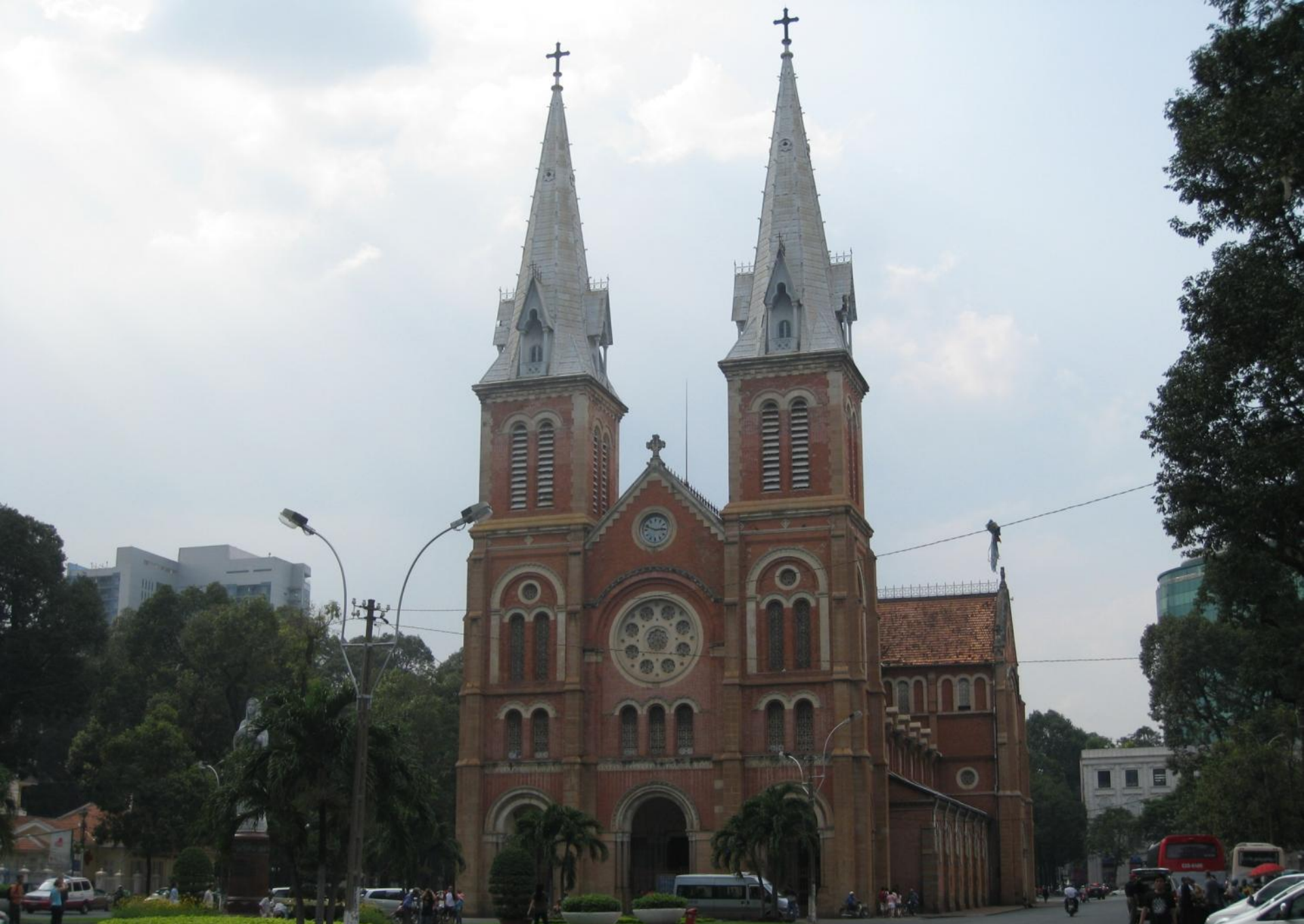
Roman Catholic Church—Downtown HCMC