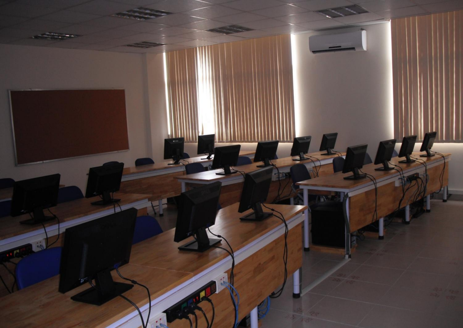
Primary—Junior Computer Lab