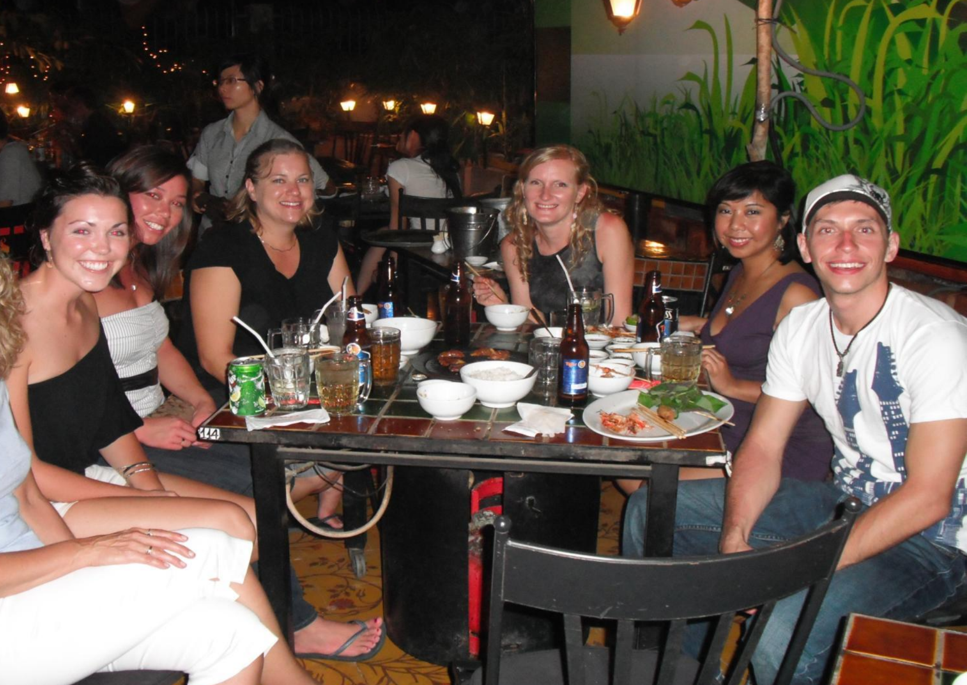
Entertaining Nightlife in HCMC