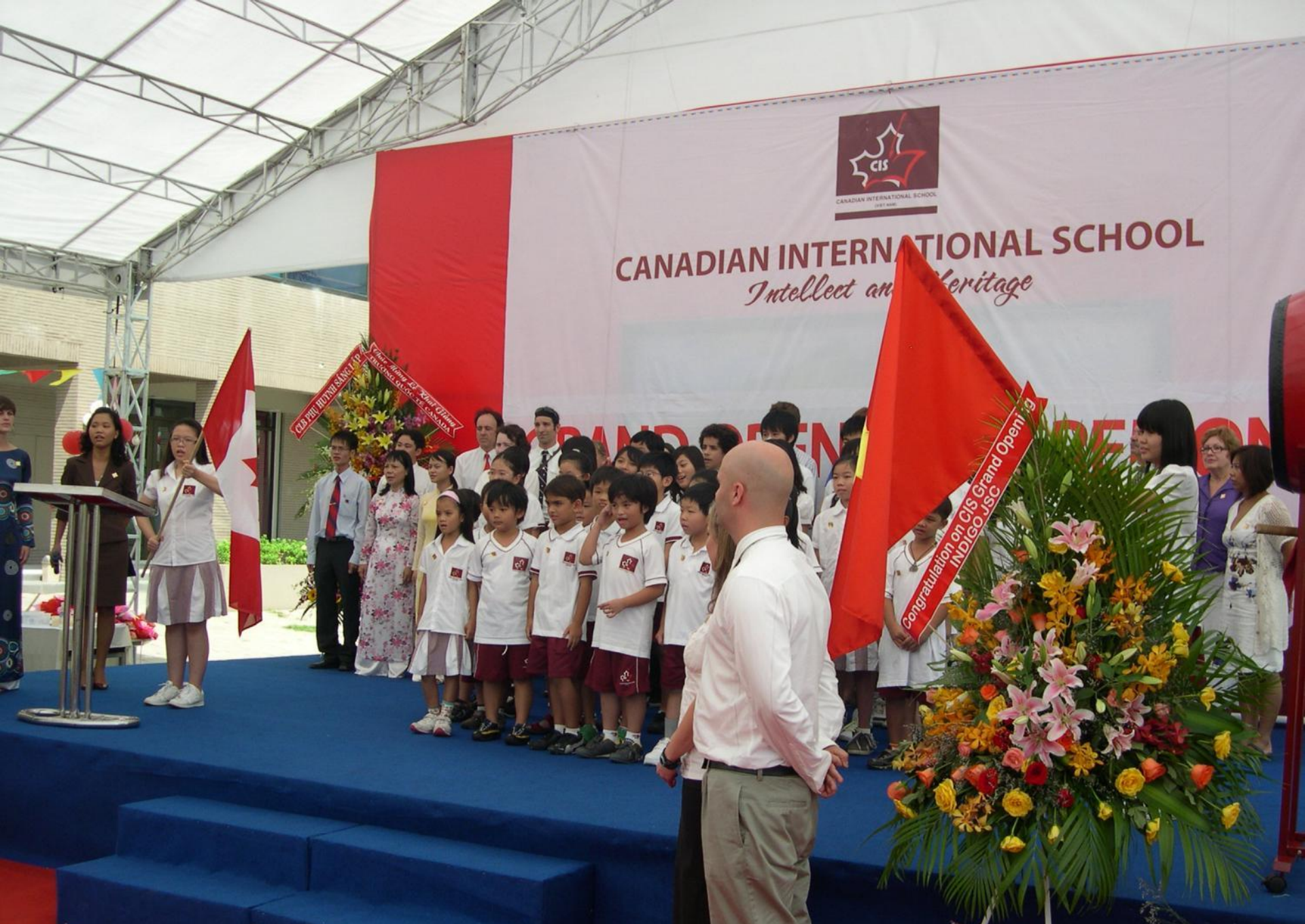
Opening Ceremony of Original, Temporary Campus of CIS, 2009