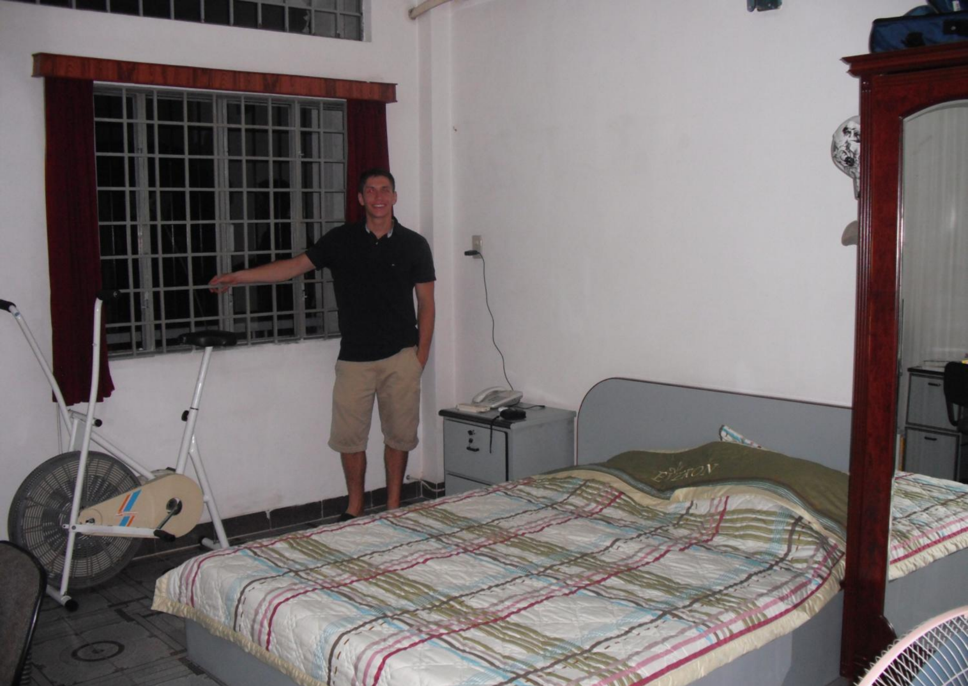
Shared 3-bedroom Townhouse in Downtown HCMC