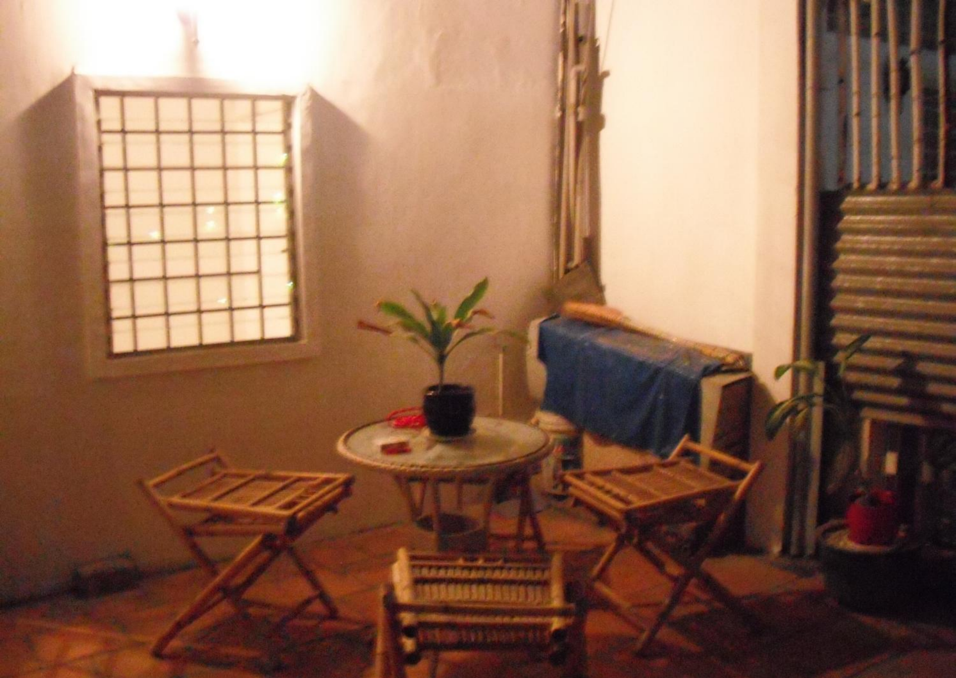
Rooftop of Townhouse in Downtown HCMC