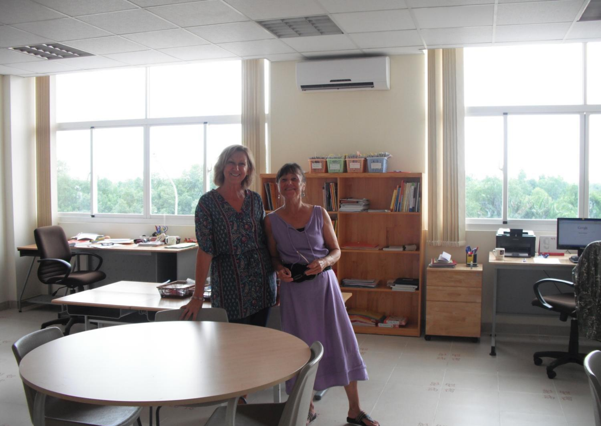
EFL & ELL Resource Room & Specialists