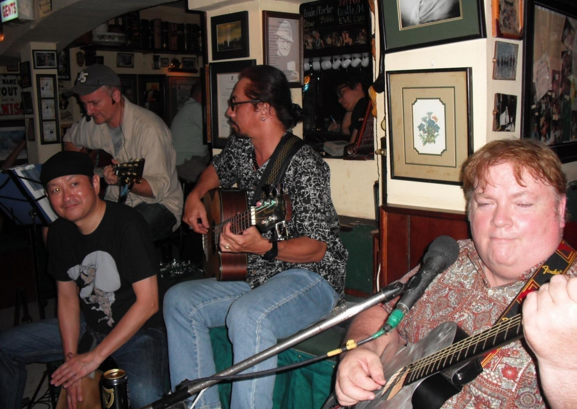
Irish Pub in Downtown HCMC