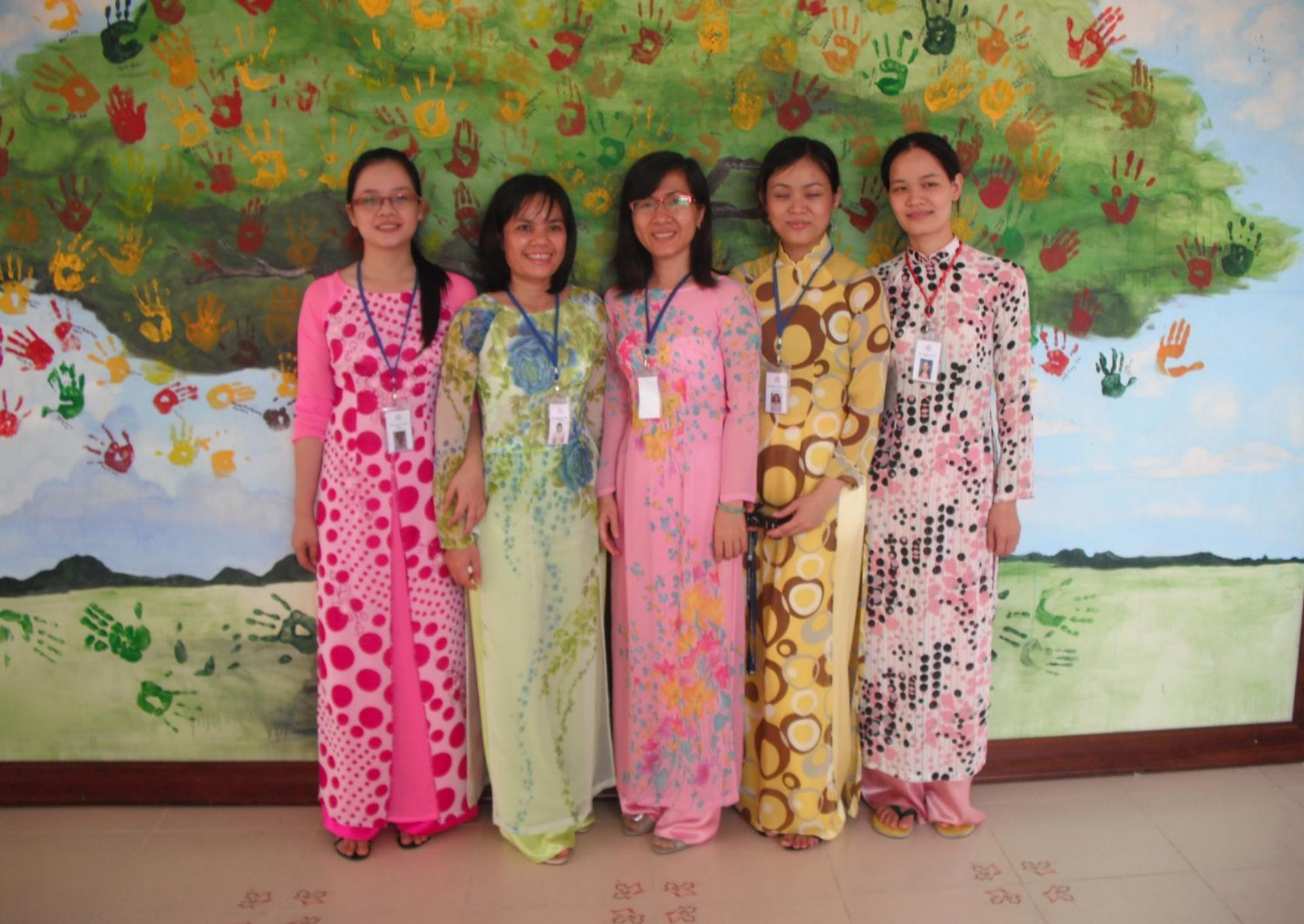
Teachers of Vietnamese Culture & Language