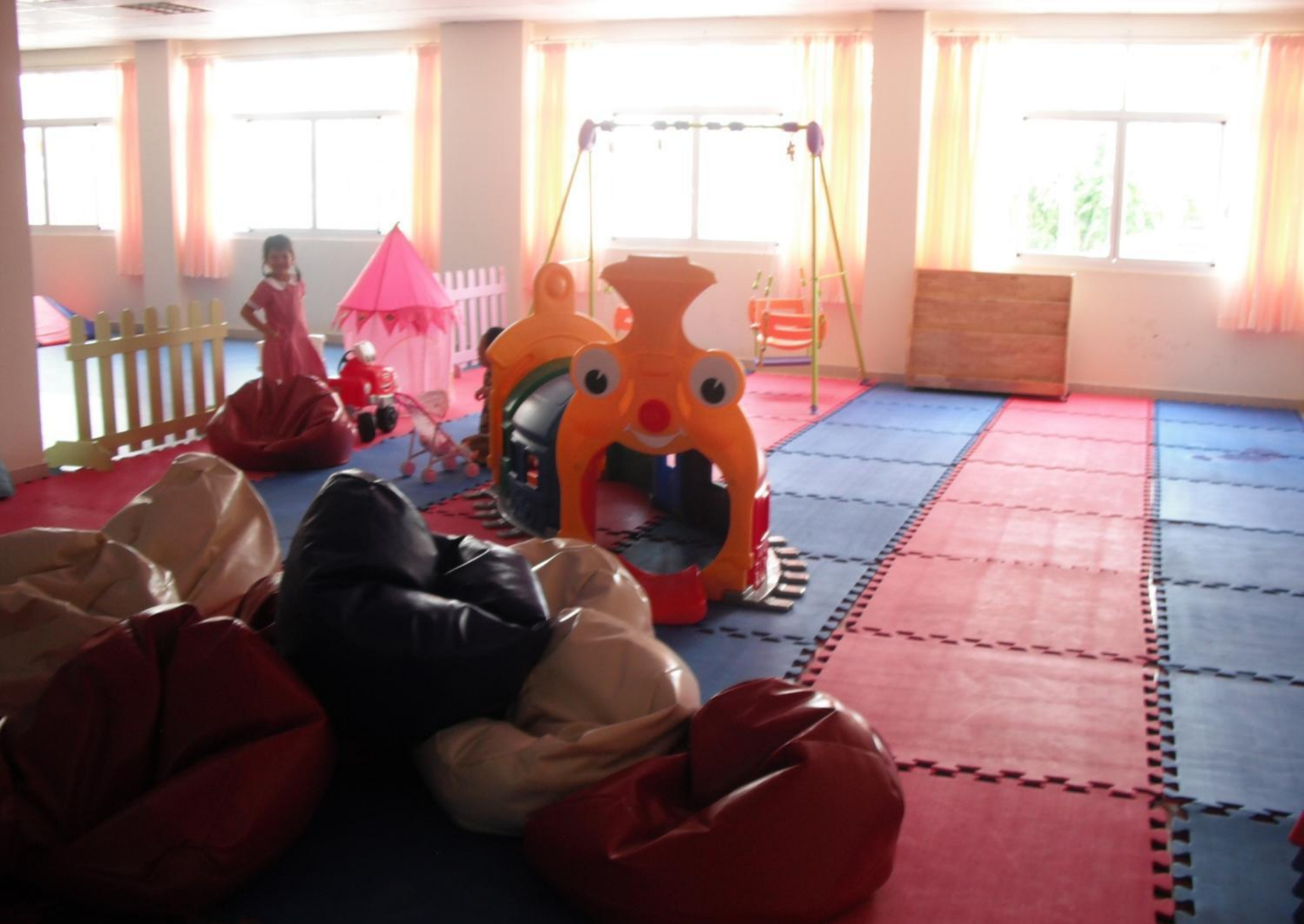
Indoor Primary Play Area