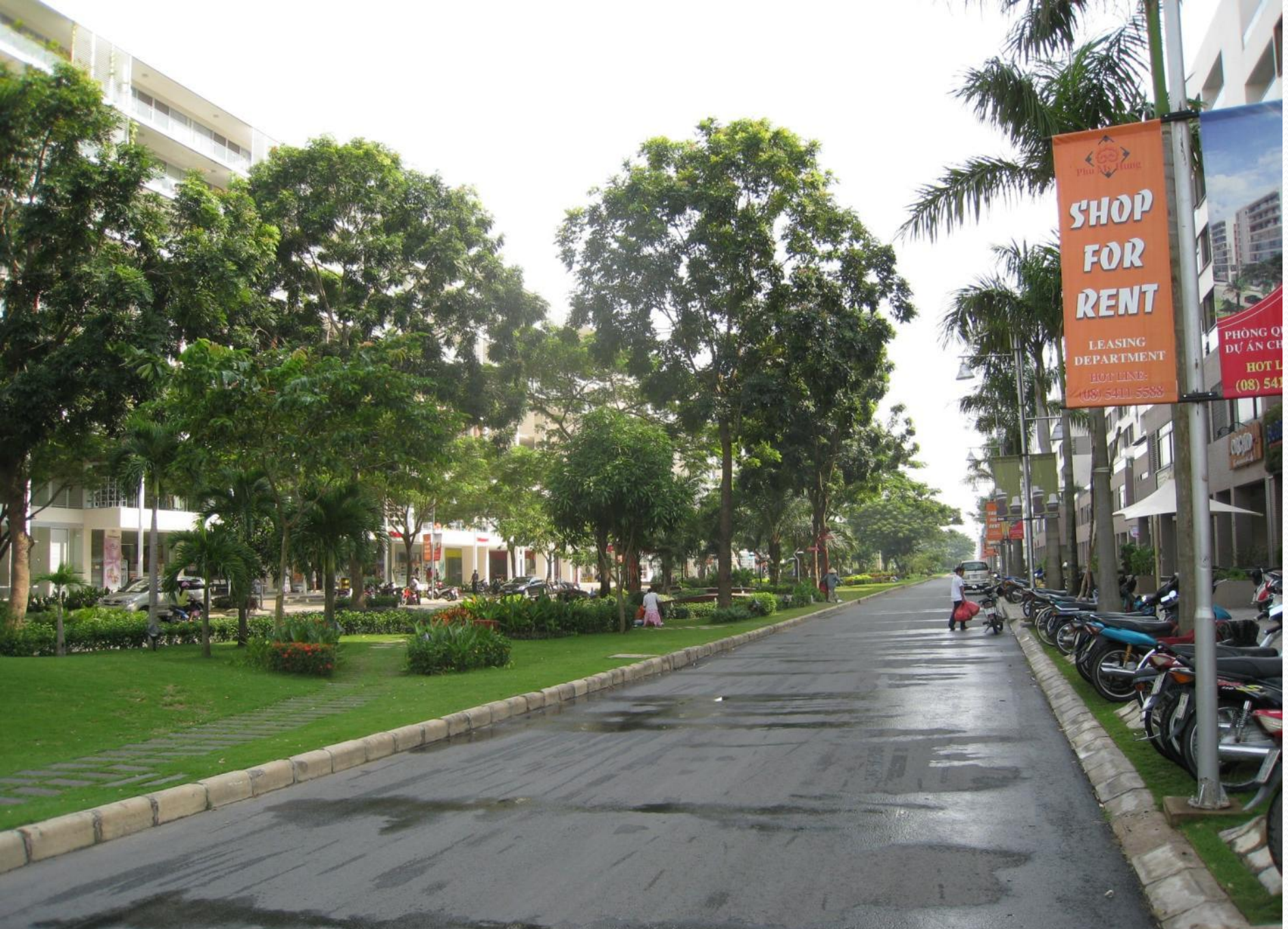
Upscale suburban area—20 minutes from CIS