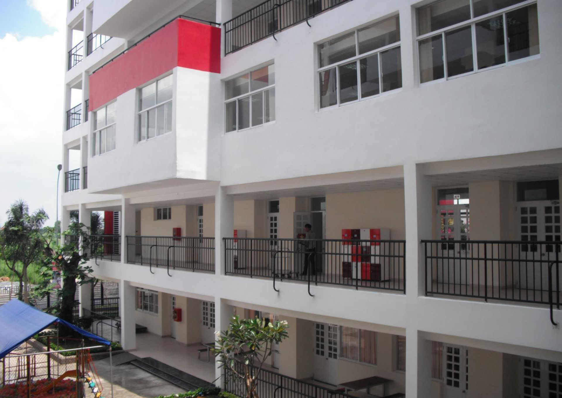
Rear Courtyard of Canadian International School—Vietnam—Six-story building