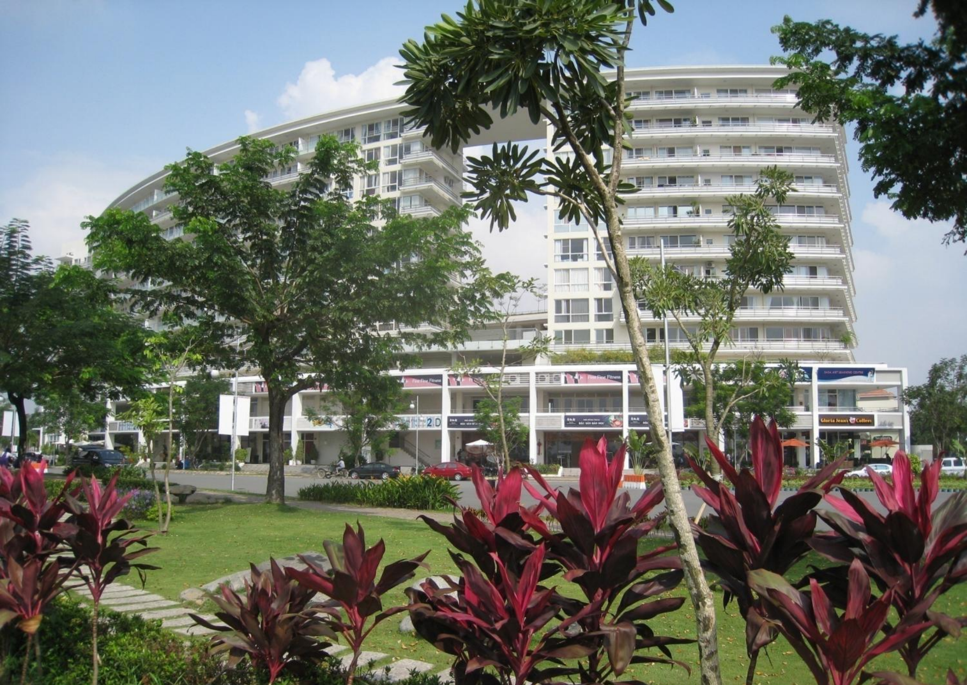
Upscale suburban area—20 minutes from CIS