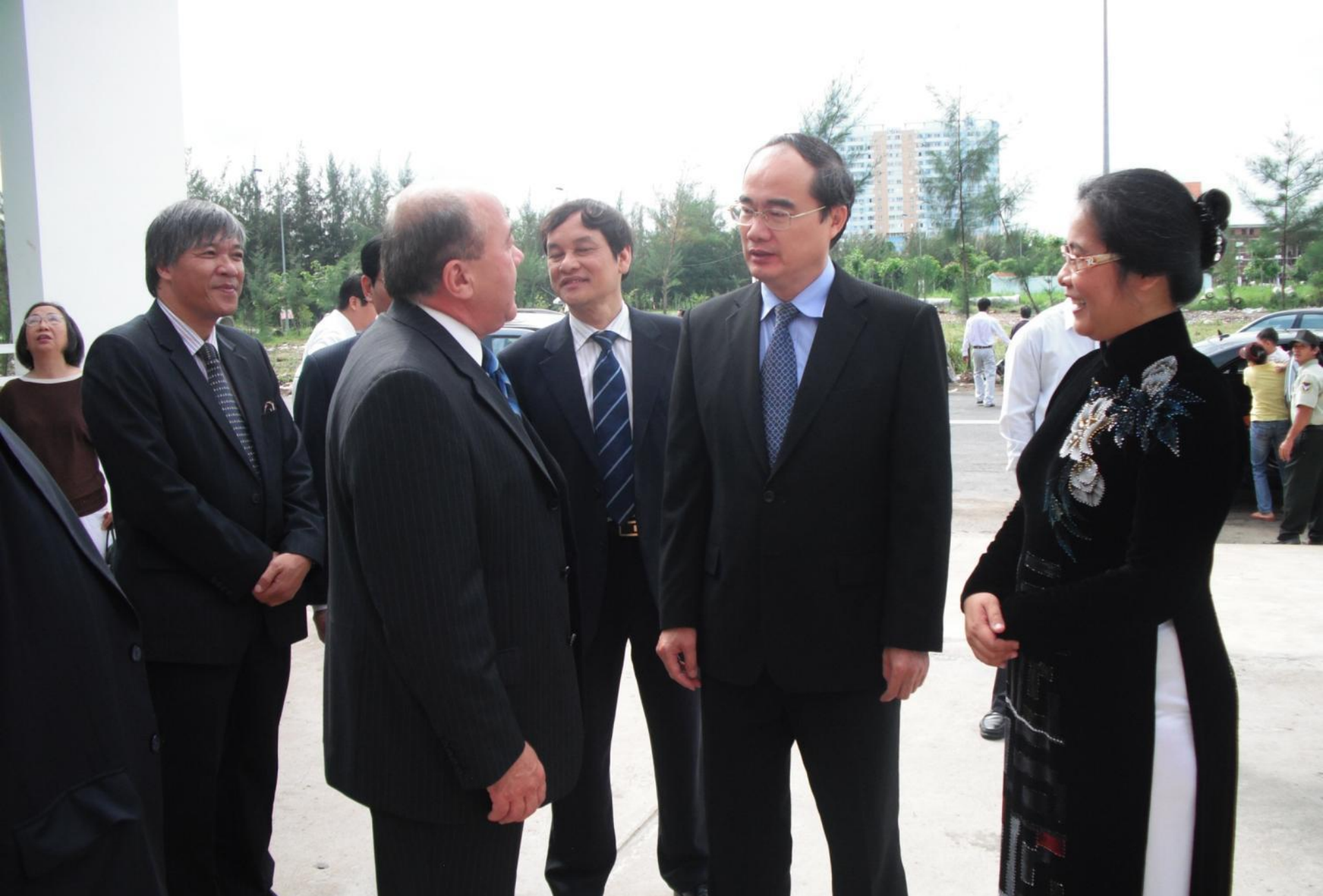
Director of Education, DSBN (left) and President, CIS Board of Directors (right) greet Deputy Prime Minister, Vietnam (centre) and HCMC Education Officials (back)