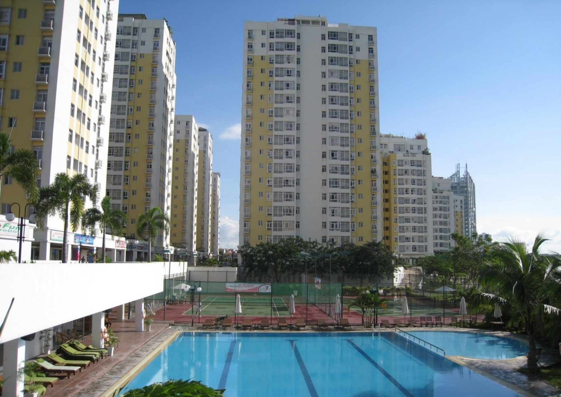
Modern Apartment Complex—20 minutes from CIS