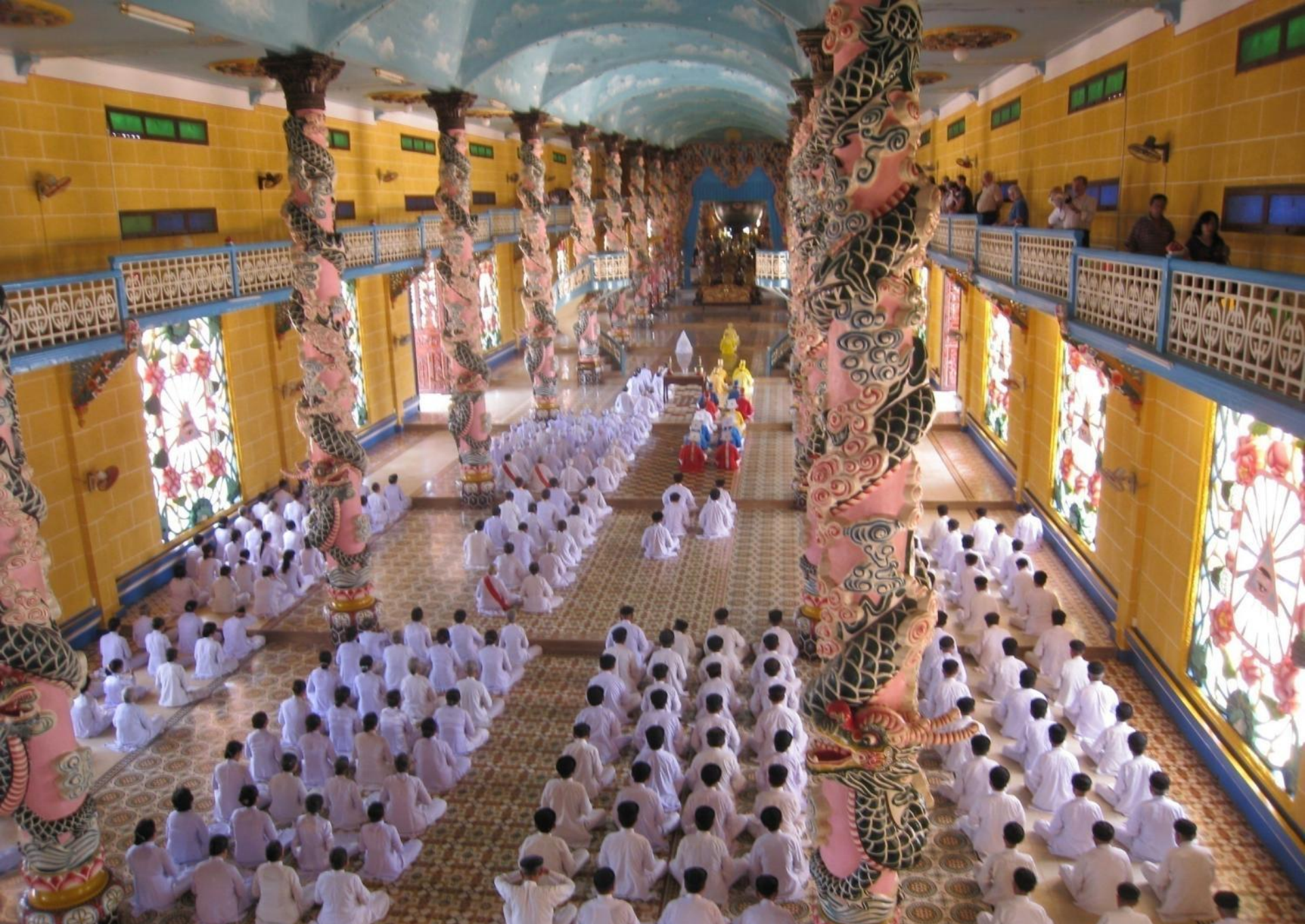
Multi-faith Place of Worship