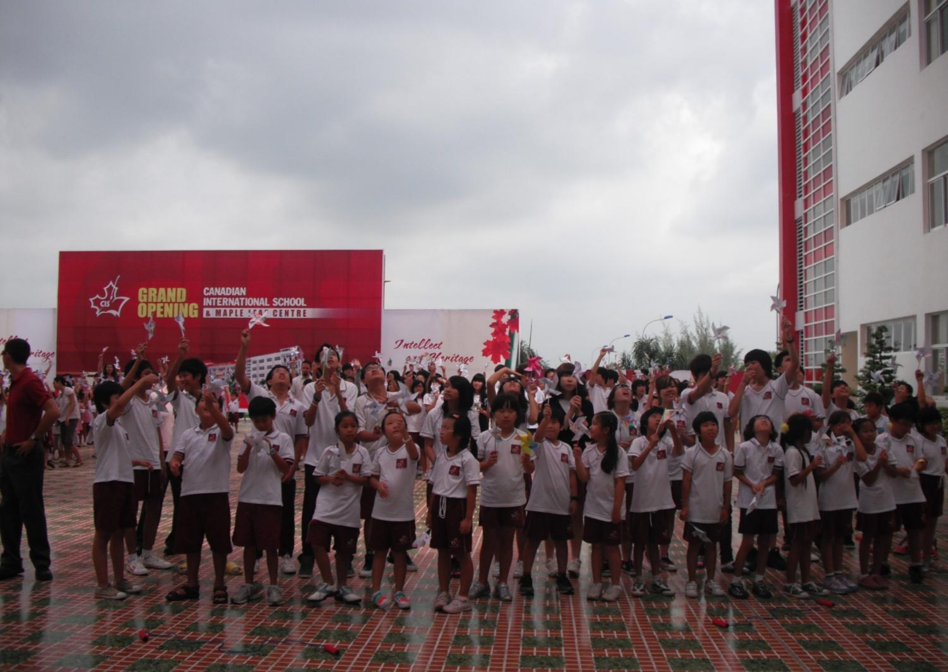
Enrolment of 480 JK-11 and growing. School capacity 1,000