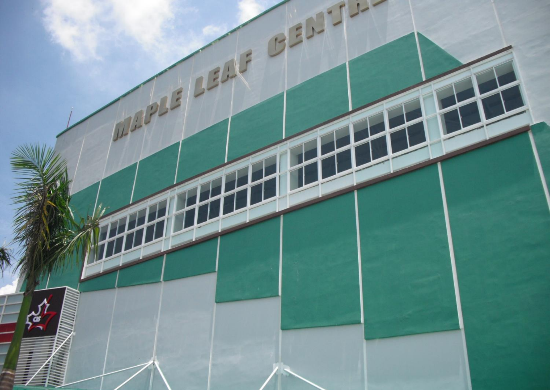
Maple Leaf Centre—an integral part of CIS