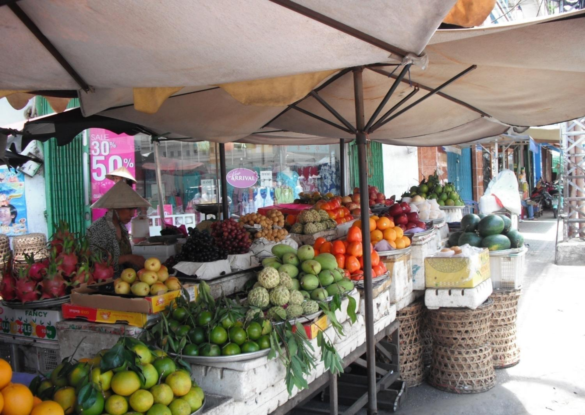
Fresh Food Markets Everywhere