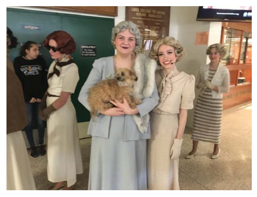
Anything Goes! Presented by Laura Secord Secondary School

Good luck to the casts and crews of both shows at the regionals in April!